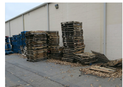
Do not store wooden palletes near your building