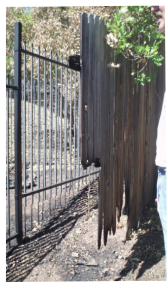
Undamaged metal fence next to a burned wooden fence

Help stop fire from spreading from the fence to your building.