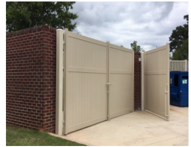
Enclosed garbage containment

containment and other outbuildings are located at least 30 feet away from your main building. If they can't be moved, consider retrofitting or enclose them with noncombustible materials.