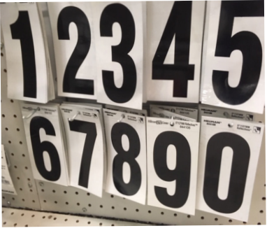
Four inch reflective numbers