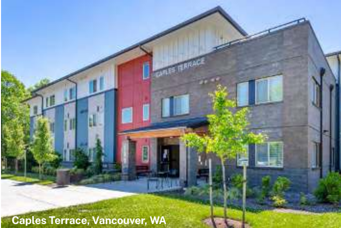
Caples Terrace, Vancouver, WA