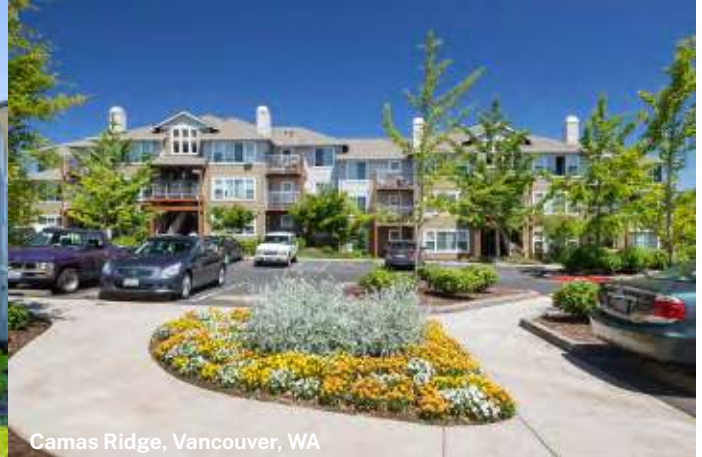
Camas Ridge, Vancouver, WA

We serve housing authorities and affordable housing providers along the west coast. We offer low cost liability and property coverage, and provide risk management solutions.