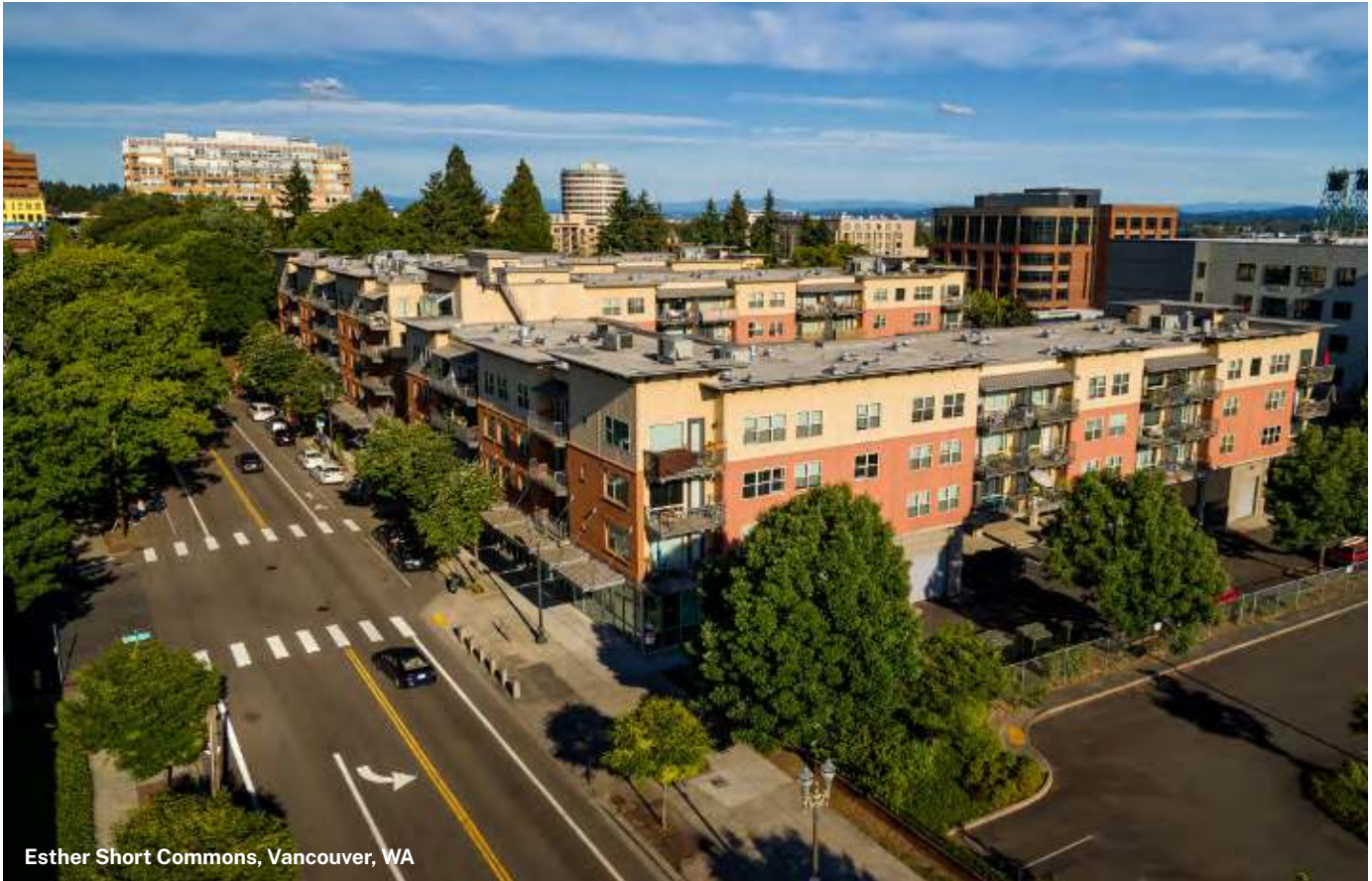
Esther Short Commons, Vancouver, WA

To assure adequate protection for your organization, you need to specify in the contract the types of insurance, limits, and enhancements needed to provide the protection desired. You also need to specify what you don't want such as harmful exclusions and limitations on the coverage applied to the additional insured.