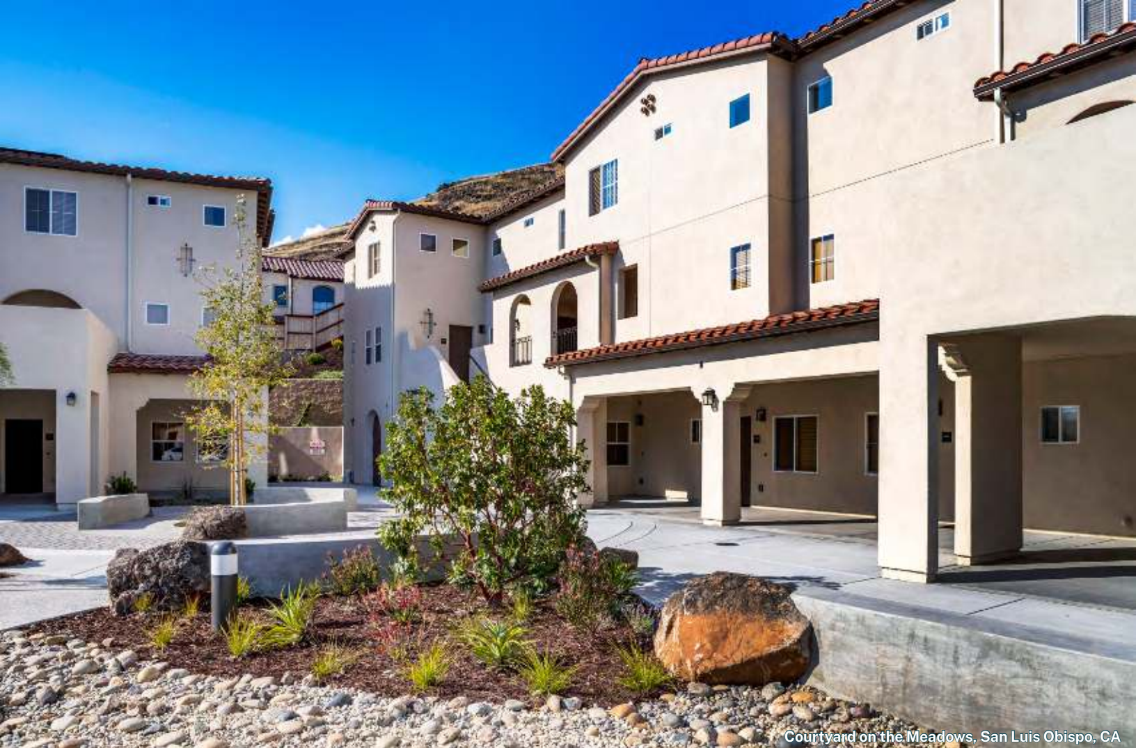
Courtyard on the Meadows, San Luis Obispo, CA