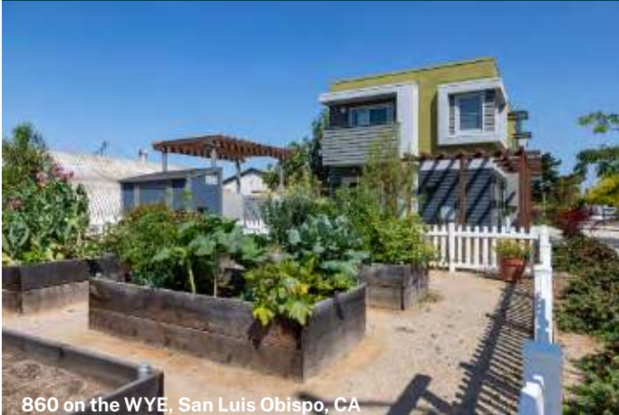
860 on the WYE, San Luis Obispo, CA

Synchronous is a member owned risk sharing group.