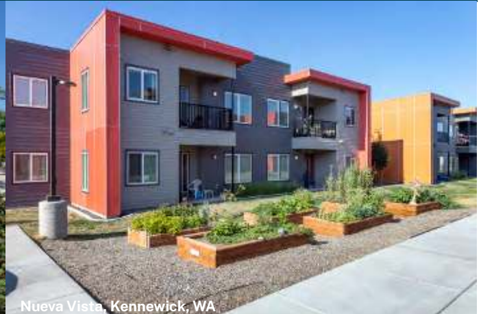
Nueva Vista, Kennewick, WA